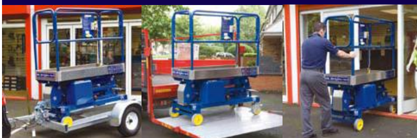
Trailer towable. Simple. Convenient. Quick.